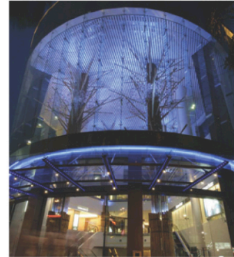
Starhill Gallery Appraised value of property RM 480 million

Tenants at the Starhill Property include Swiss Union, Cortina Watch, Louis Vuitton, Gucci, Asprey, Christian Dior and Chopard.